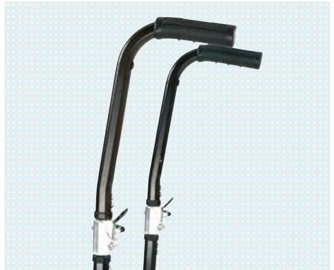
• Folding back tubes for easy and space-saving transportation