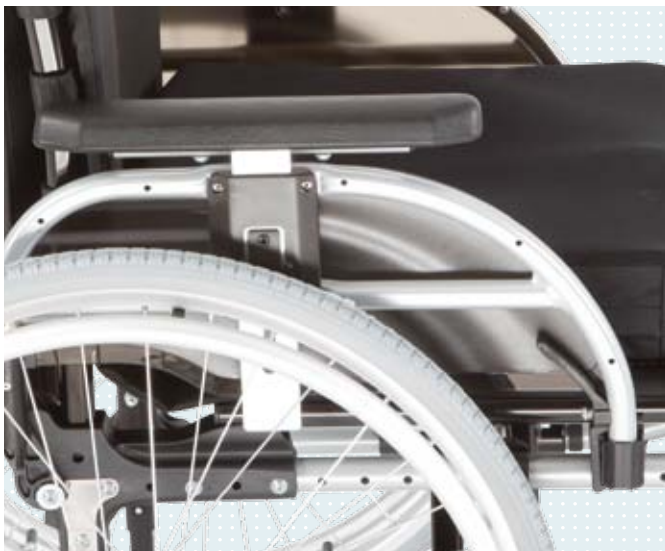
• Side panel with height-adjustable arm rest