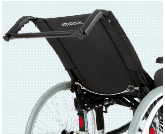
• Angle-adjustable back can be easily adjusted without tools