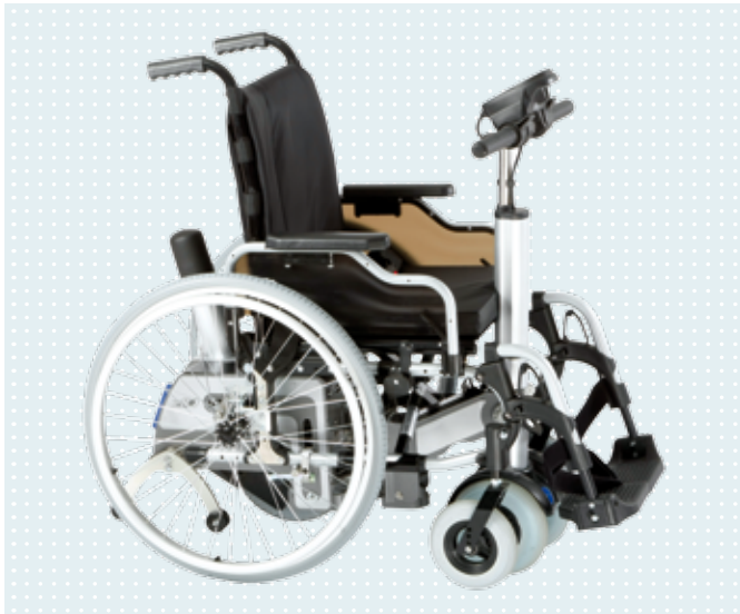
• Start M2 Effect with z10-ce add-on drive