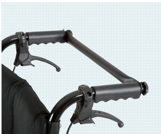
• Back stabiliser improves stability and can be swung out of the way for folding