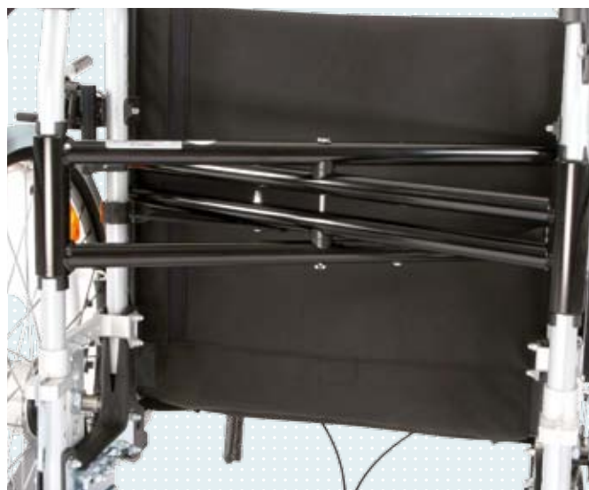
• Double crossbrace permits a maximum load capacity of 160 kg