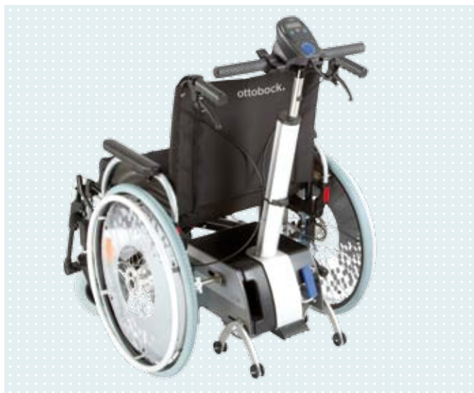
• Start M4 with z10 push assist