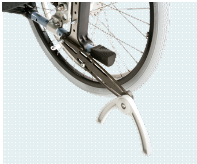
• Optional swinging anti-tipper allows to overcome low obstacles without deactivation